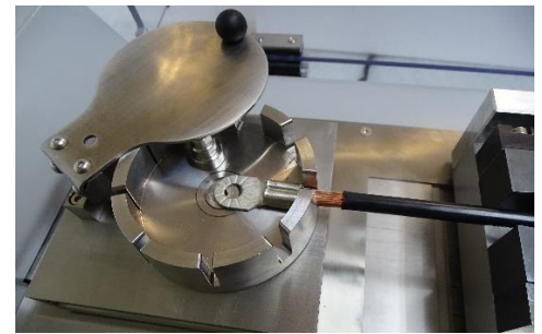
Wheel with slots for various terminals